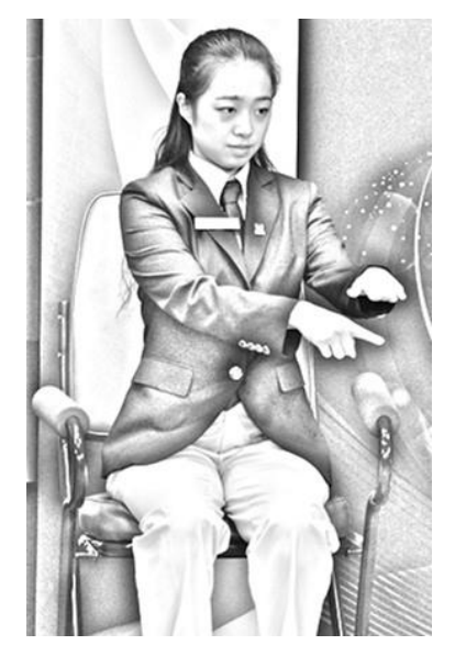
Figure 4 Below the playing surface