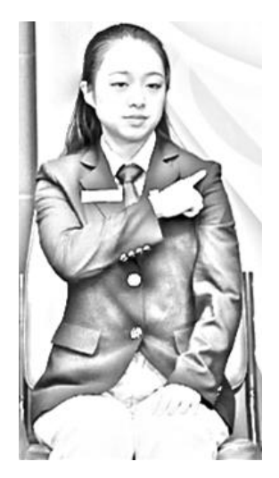
Figure 7(1) Verbal communication: Hidden by shoulder