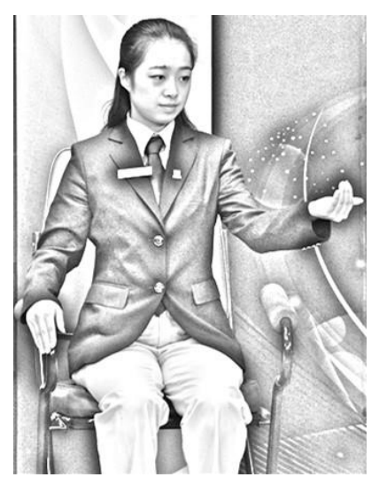
Figure 2 Palm not opened