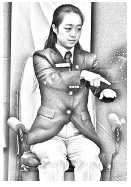
Figure 5 Inside the end line

6. If the ball does not project near vertically upwards, umpire or assistant umpire shall do: