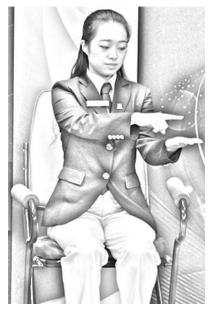
Figure 1 Not high enough

Verbal communication : Not high enough Hand signal : Figure 1