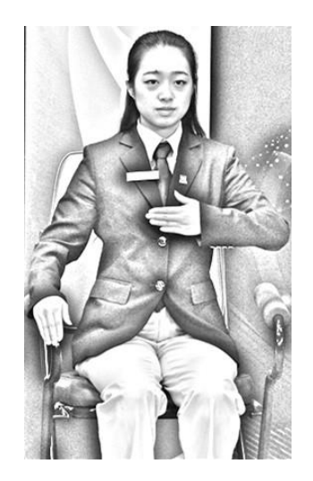
Figure 7 Hidden by what or whom

If the player asks the reason why or where, the umpire will use his or her index finger to show it. For example: If the ball is hidden from the receiver by the server's shoulder, the umpire's action is as follows: Verbal communication : Hidden by shoulder